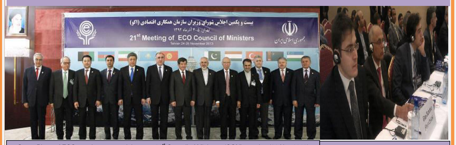
Group Photo of ECO member states ministers at 21<sup>st</sup> Council of Ministers (COM) meeting (26 Nov 2013)

The President ECOSF made his statement highlighting the progress of ECOSF. ECOSF budget for 2013 was also approved in the meeting. After the inaugural, the COM meeting was chaired by the Foreign Minister of Iran.