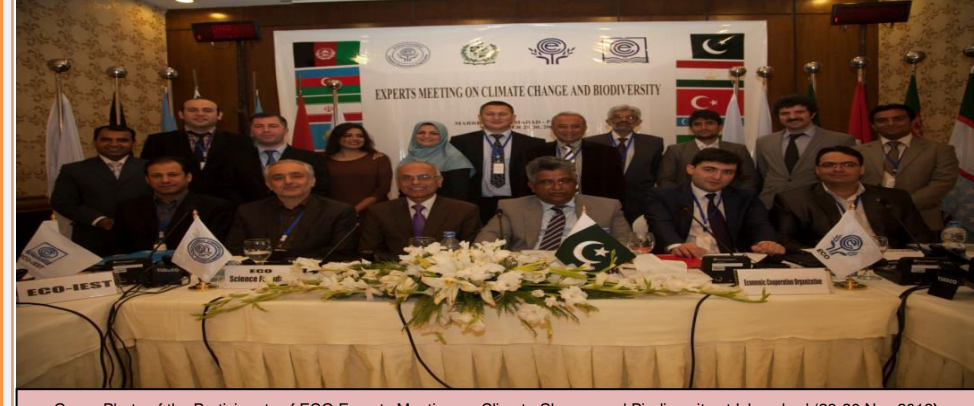
Group Photo of the Participants of ECO Experts Meeting on Climate Change and Biodiversity at Islamabad (29-30 Nov 2013)

The representatives of the Islamic Republic of Afghanistan, the Republic of Azerbaijan, the Islamic Republic of Iran, the Kyrgyz Republic, the Islamic Republic of Pakistan, and the Republic of Turkey delivered their presentations/statements encompassing their countries environmental policies, programmes, challenges, projects and activities carried out in the field of environment particularly on climate change and biodiversity issues.