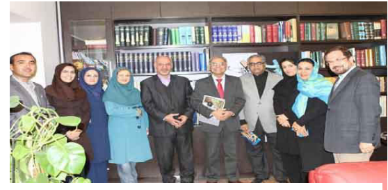
The President ECOSF's Group Photo with the Officials of ECO Cultural Institute (ECI)

During the visit, both the Presidents briefed each other about various ongoing and future plans of their organizations and shared mutual interests to collaborate for the benefits of ECO region as