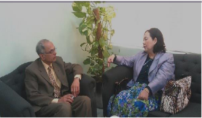
other cross border scientific, educational and cultural activity.

The two leaders also discussed the possibility of working on Transboundary Biosphere Reserves between Pakistan and the Bordering ECO Member States as well as any