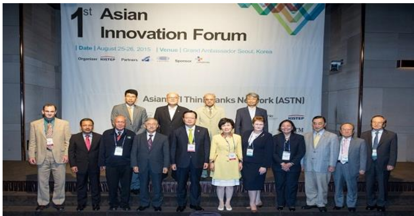
Group photo of 1st AIF leaders and speakers 25 August 2015