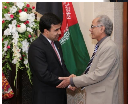
President ECOSF (right) is being welcomed by the Ambassador of Afghanistan to Pakistan