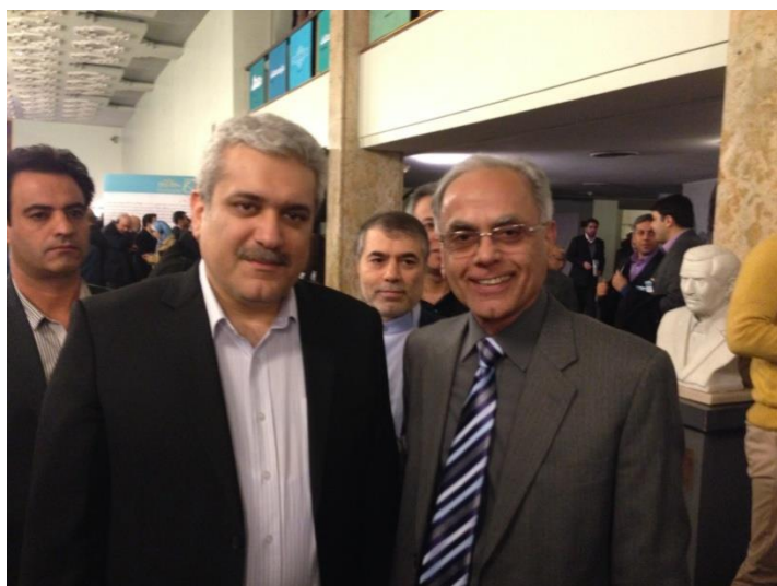
President ECOSF with Vice President of Iran for Science & Technology Dr. Sourena Sattari during Mustafa Prize Award Ceremony

The Mustafa Prize is purposed to encourage and to promote science and technology development in order to enhance the quality of life by appreciating the top works of Scientists within the Islamic world. It is to improve scientific relations between academics and researchers in order to facilitate the growth of science in OIC Member state. It is one great prize to encourage the development in science and innovation technologies and its implication in the Muslim world.