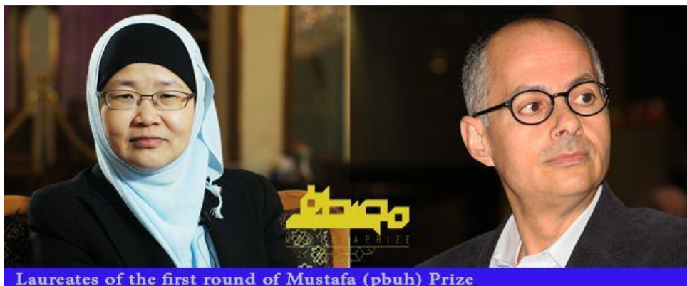
Laureates of the first round of Mustafa (pbuh) Prize

The Mustafa (PBUH) Prize for significant contributions in the field of science and technology in the Islamic World was launched recently in Tehran, Iran with the announcement of two prizes for 2015. The first ever Mustafa Prize Award Ceremony was held on Friday December 25 at Vahdat